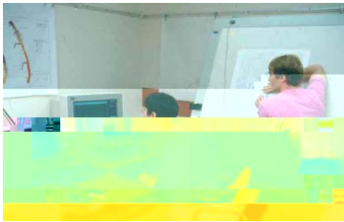
Fig. 2. "Digitizing and "interactive" editing"