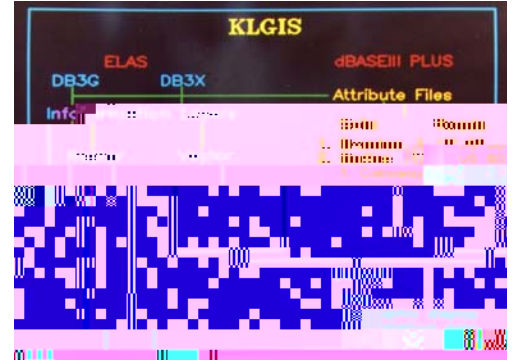
Fig. 1. "KLGIS Data Software"

In the early years, basic limnological measurements were entered by hand into database