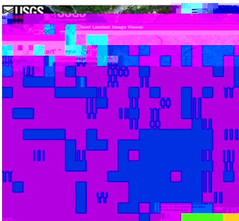
Fig. 4. "USGS website for viewing "live" Landsat data"